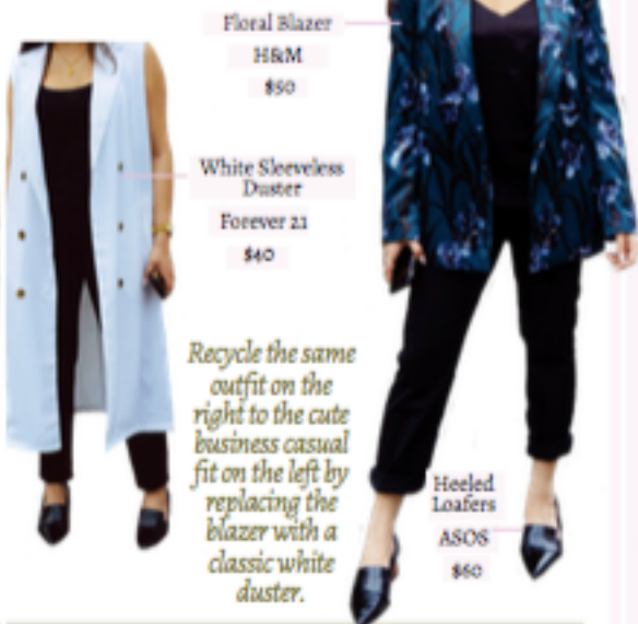
Floral Blazer H&M $50

"My style in 3 words: Simple. Classy. Unique. I love minimalism."